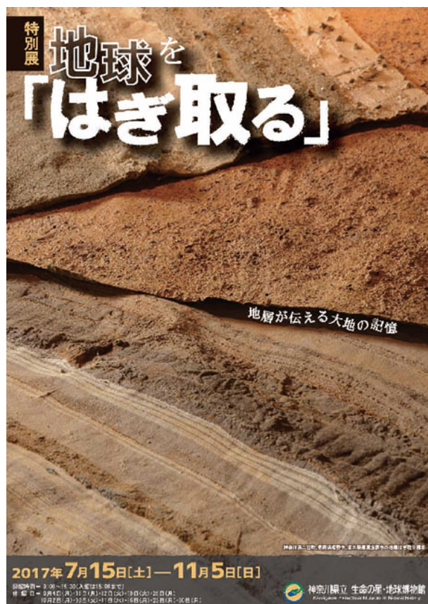
Fig.1 Flyer of the special exhibition.

Keywords: surface peel specimen, exhibition, art