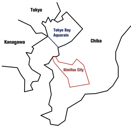
Fig.2 The location of Kimitsu City