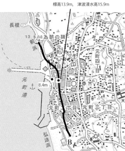
図3 現代の大島元町の地形図 太実線は流失家屋範囲限界